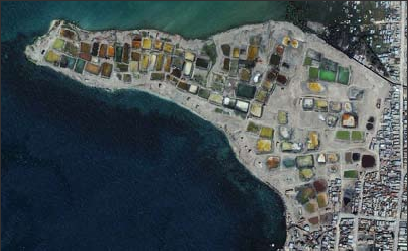
Before: Satellite view of Gonaives, Haiti