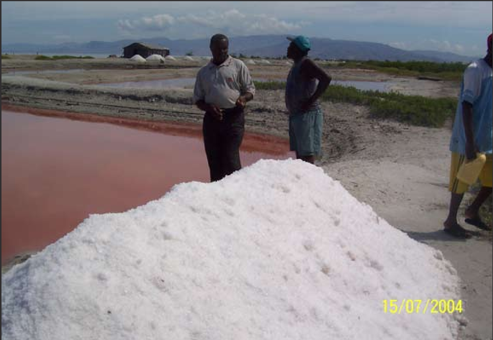
Salt Pond: Gonaives, Haiti