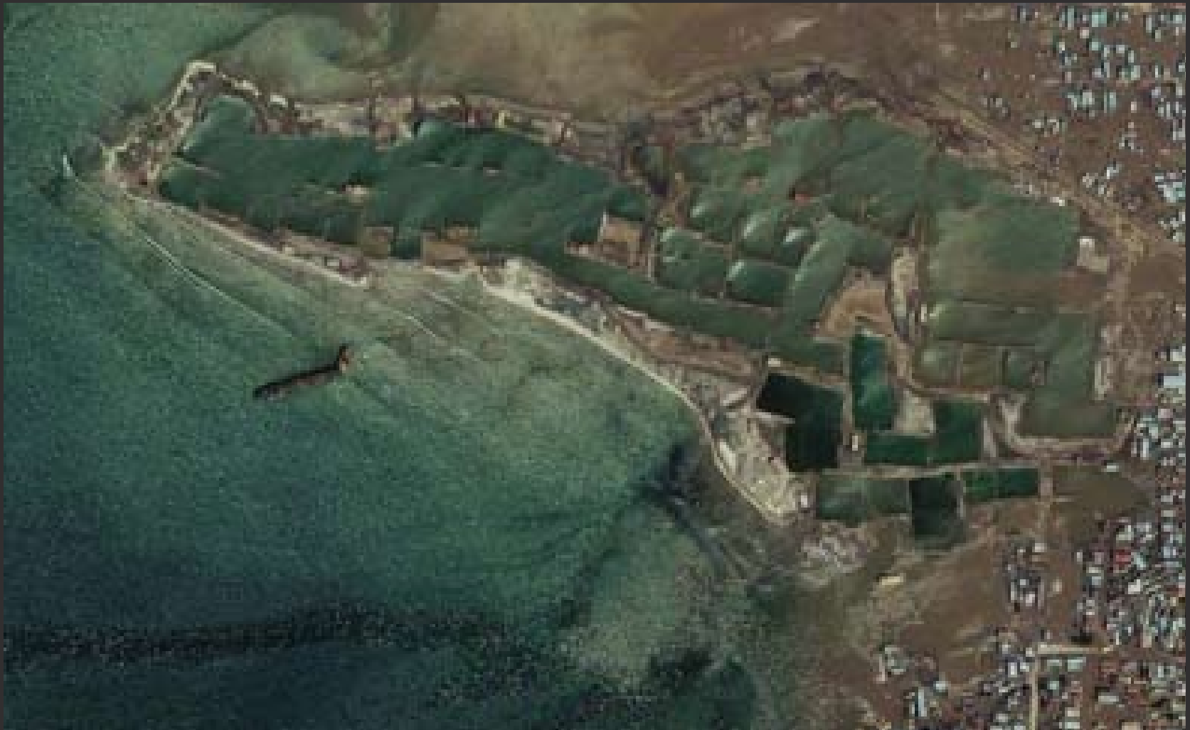
After: Satellite view of Gonaives, Haiti